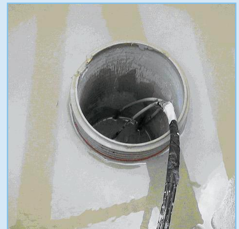
Optical Strand in injected bores.