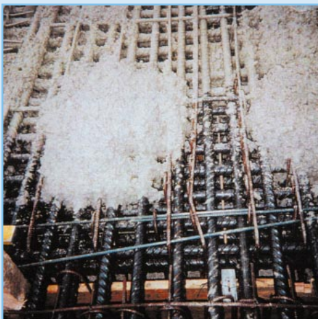
Optical Strand during concrete pouring.