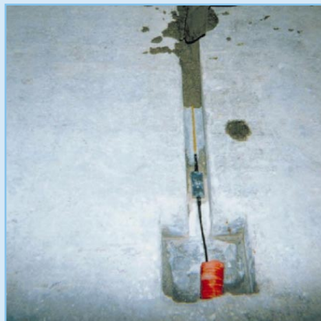
Optical Strand post-installed in mortar.