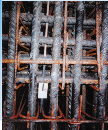
Optical Strand in a reinforcing cage.