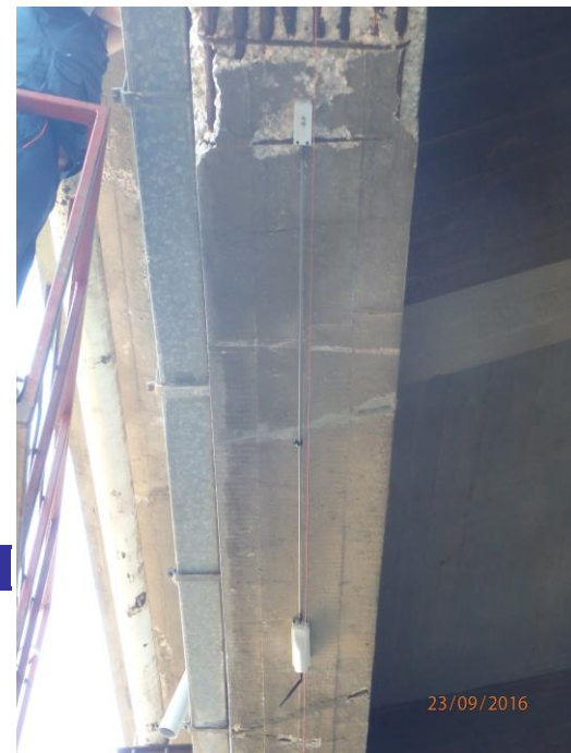
LIRIS Optical Strand on a beam under the deck

Thanks to OSMOS results, doubts concerning the bearing capacity of the bridge have been eliminated and the client is able to decide to remove the current vehicle load restrictions, thus avoid further strengthening works. The client is sure of the bridge stability and can continue its operation with full safety.