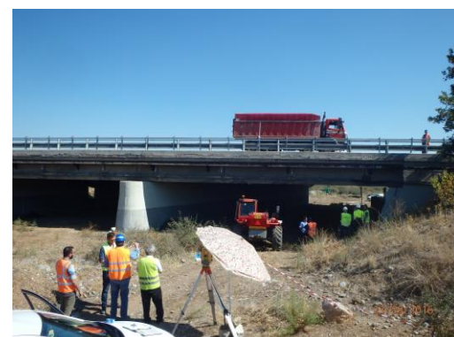
Loading test with a truck