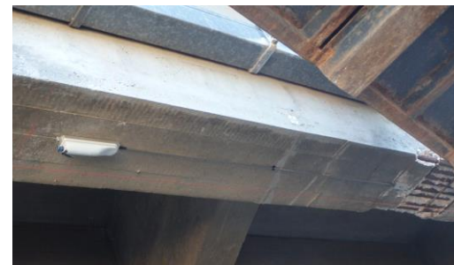
LIRIS Optical Strand on a beam under the deck