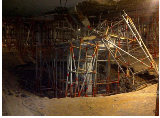
Structure after collapse